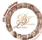
DVL Honorees Award Entrepreneurialism, expression in the visual or performing arts, or community service.