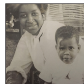
Weatherspoon Family Encouragement Award

To learn more about the Legacy Scholarship Namesakes & Awards visit: dvlproject.com